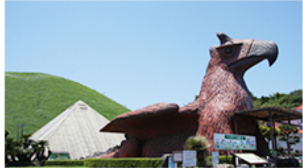
Izu Cactus Park is right in front of the beautifully formed Mount Omuro.

The popular capybaras bathing in hot springs is a quintessential wintertime sight.