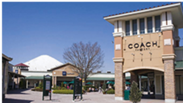
Enjoy shopping at “Gotemba Premium Outlets®” while taking in views of Mt. Fuji

Access is very convenient thanks to the Fujikyu Bus from Lake Yamanaka (“Hotel Mt. Fuji Iriguchi”), which takes around 60 minutes and arrives at the entrance to Gotemba Premium Outlets®.