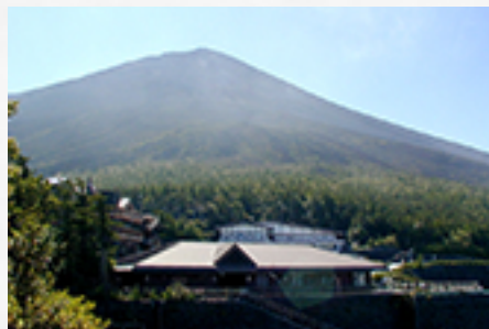
The summit as seen from the Fifth Station looks quite different to other views of Mt. Fuji

*This bus service may not be running due to road conditions on the "Fuji Subaru Line" that passes through the bus route. Please check in advance to confirm that buses are running.