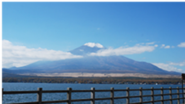
Lake Yamanaka is the perfect place from which to view Mt. Fuji as it reflects in the lake surface

There are also many hotels and pensions close to the lake, making this area the ideal place to spend a night.