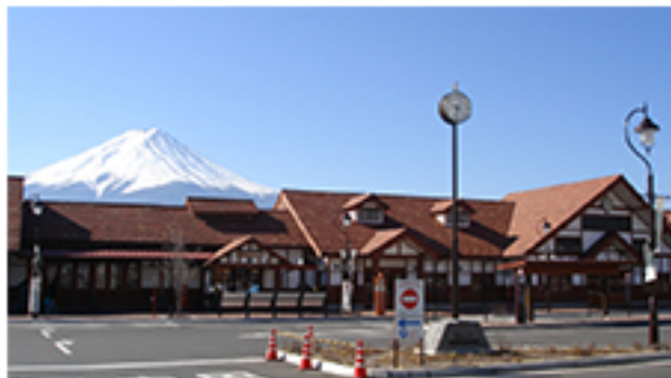
Kawaguchiko Station provides views of Mt. Fuji at close proximity

Kawaguchiko Station is already at a height of 857 m above sea level, so please beware of changes in temperature.