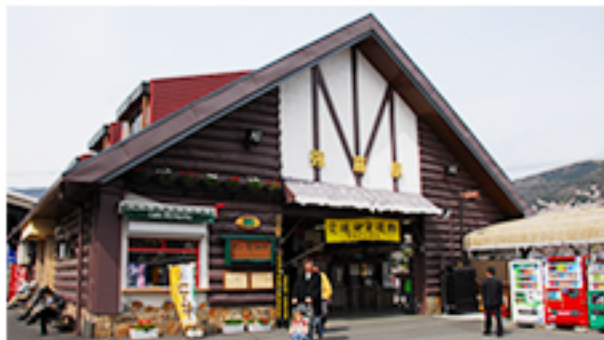
The area at the front of Gora Station is bustling with souvenir shops and dining options

“Fukuyoshi” is just a minute’s walk away from Gora Station. Here you can experience unique Japanese soba noodle cuisine