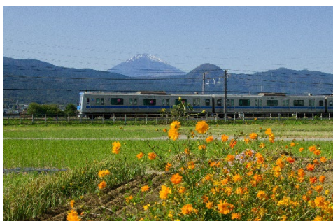
Odakyu commuter train

The purpose of these revisions to the shareholder benefit program is to thank shareholders for their continued support and to make investment in the Company's shares a more attractive proposition for more people. Additionally, through shareholder benefits, the Company intends to give shareholders greater opportunities to experience first-hand the Group's various services, including railways.