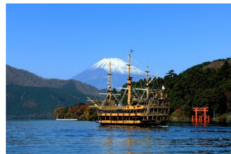
Hakone Sightseeing Cruise

The Company plans to expand "long-term shareholder benefits," starting from shareholder benefits to be sent to shareholders as of the end of September 2026. These benefits will additionally be made available to those who have continuously held a certain number of shares for three or more years, and the minimum number of shares required to be held for eligibility will be lowered from "1,500 shares or more" to "500 shares or more." The benefits provided will also be expanded.