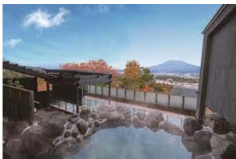
Konohana no Yu