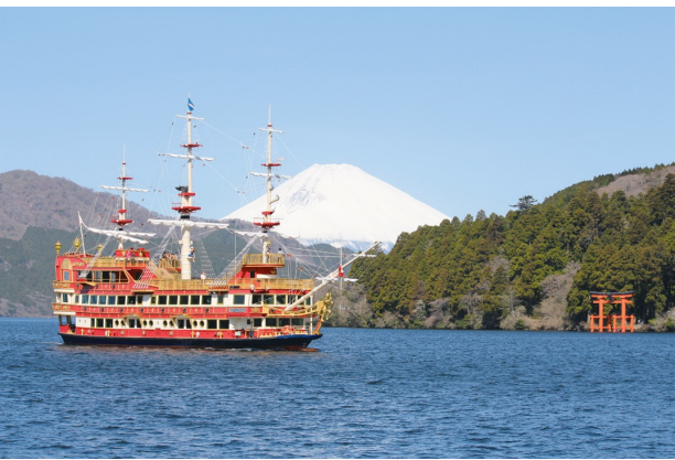
[Hakone Area] Lake Ashi Sightseeing Cruise

ODAKYU ELECTRIC RAILWAY Co., Ltd., FUJIKYUKO Co., Ltd., and Keio Bus Higashi Co., Ltd. will be launching a renewed "Fuji Hakone Pass" on April 1, 2016.