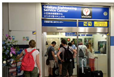
Shinjuku Odakyu Sightseeing Service Center