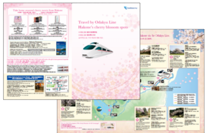
Pamphlets introducing information on cherry blossoms in the Hakone area