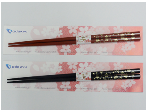
Chopsticks with cherry blossom designs (Image)

Coupons that can be used in twenty-two restaurants and cafes at our commercial facility “Shinjuku Mylord” in Shinjuku, which is the point of departure for sightseeing trips in Hakone, will be distributed during the campaign.