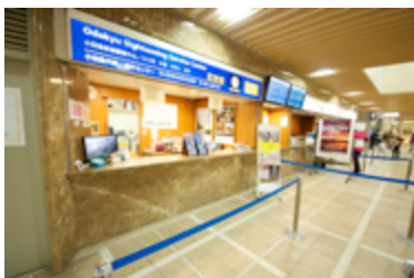
Odakyu Sightseeing Service Center