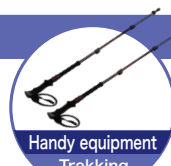
Handy equipment Trekking sticks