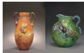
• "Two Handled Vase with Flowers Design" ca.1895 Pola Museum of Art • ca.1903 Private Collection

■ Take the Hakone Tozan bus to the Pola Museum.