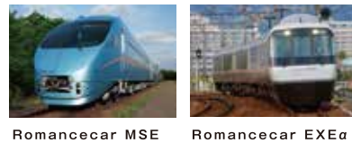
Romancecar MSE Romancecar EXE

Additional limited express surcharge is required for the Romancecar.