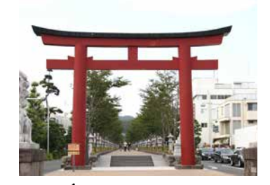
Access 🐧 10-minute walk from Kamakura Station

Every spring, Tsurugaoka Hachimangu Shrine's Genji-ike Pond is engulfed with breathtaking cherry blossoms. The young cherry trees planted along the Dankazura add a splash of color to the raised pathway leading to the main shrine, a nationally designated as a National Historic Site.