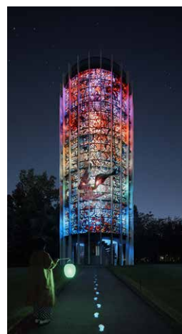
高橋匡太 《Glow with Night Garden Project in Hakone》 ガブリエル・ロアール 《幸せをよぶシンフォニー彫刻》