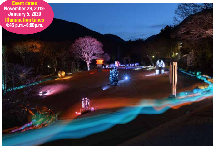
高橋匡太 《Glow with Night Garden Project in Hakone》

Event dates November 29, 2019 - January 5, 2020 Illumination times 4:45 p.m. - 6:00 p.m.